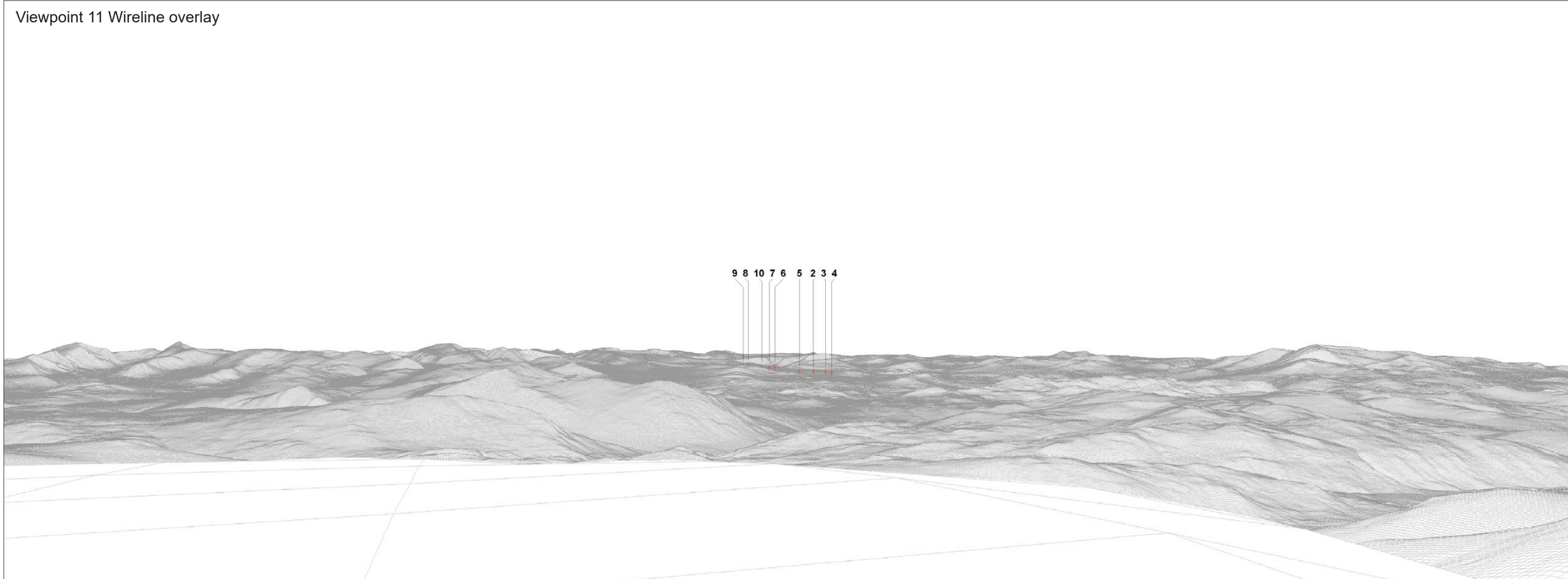
Viewpoint 11 Wireline overlay