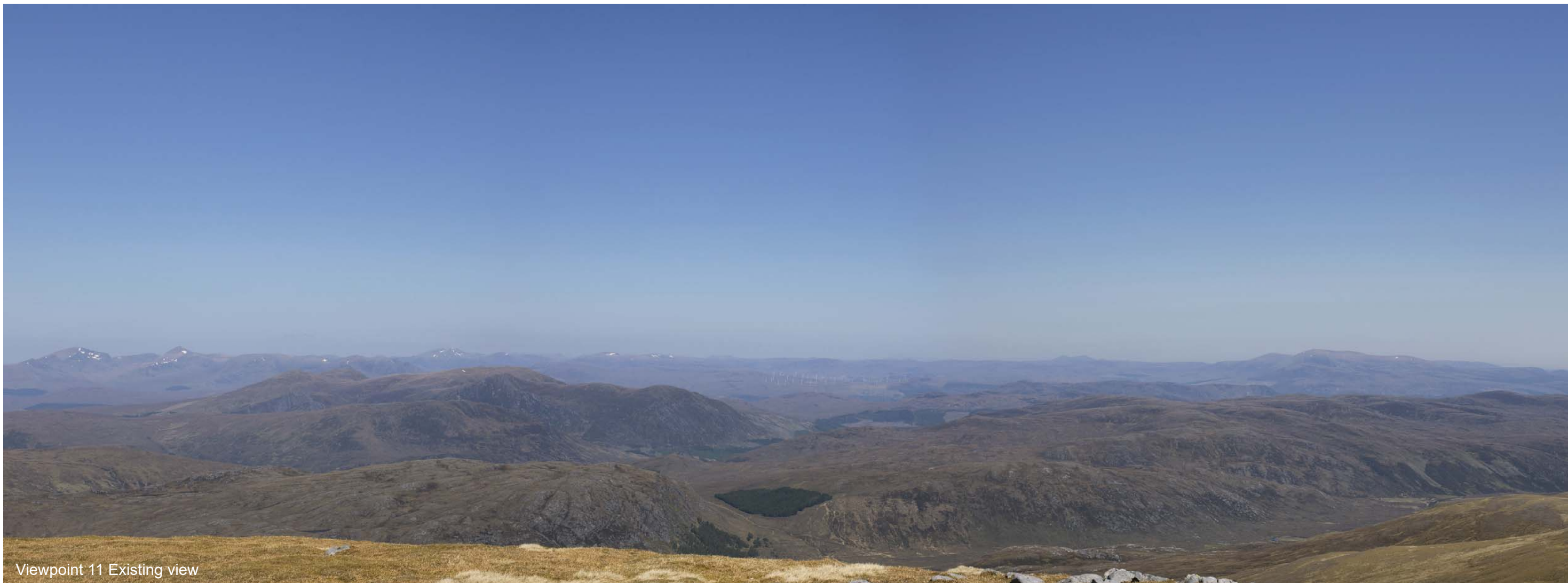
Viewpoint 11 Existing view